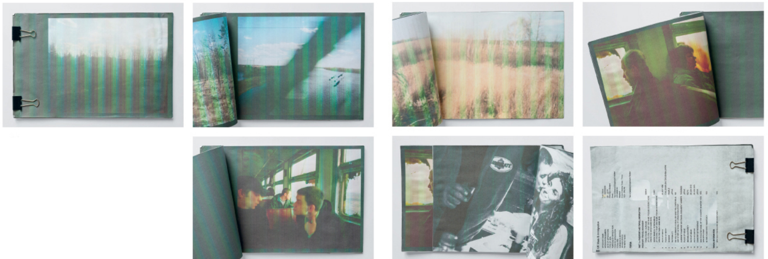
Untitled, 28.7 x 19 cm, Dummy by Kazuma Obara

The Japanese photographer published « 30 » in 2016. It deals with the Chernobyl disaster in 1986. The handmade edition of 86 copies contains the three titles «Exposure», «Everlasting» and «Newspaper».