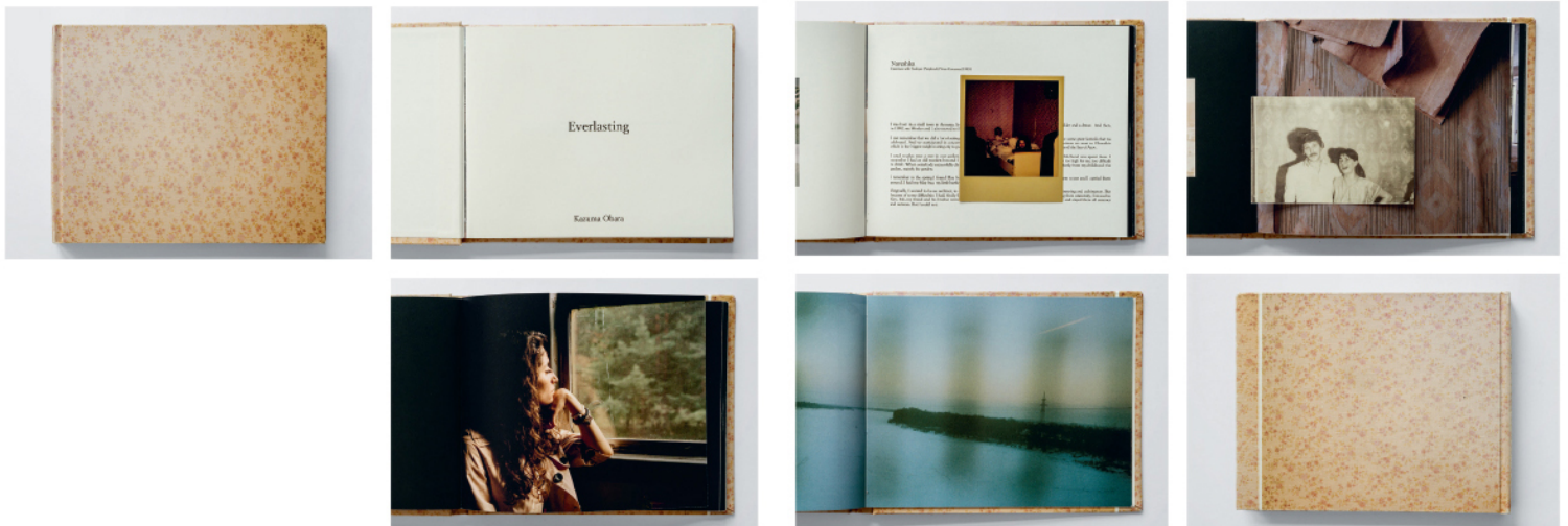
Everlasting, 23.8 x 19 cm, Dummy by Kazuma Obara