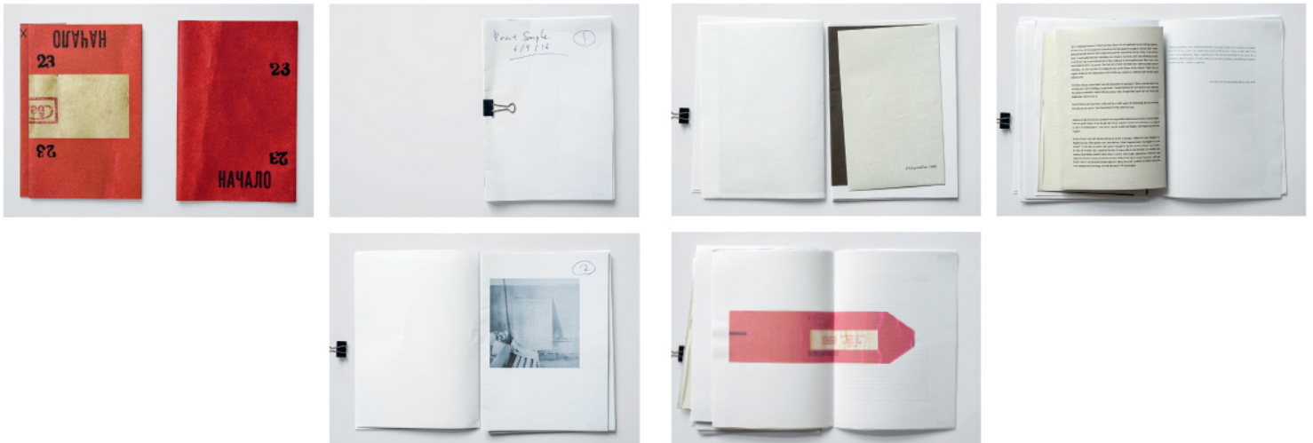
exposure, 14.8 x 21 cm, Dummy by Kazuma Obara

Portfolio with a sequence of 8-12 images from a reportage or a series.